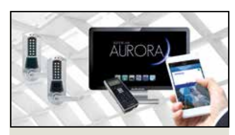
E-Plex 5700 offline with Keyscan Aurora and M-Unit handheld