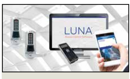
E-Plex 5700 offline with Keyscan LUNA and M-Unit handheld